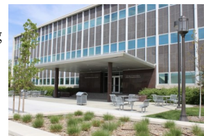
Andersen Hall, 16th and Q streets in Lincoln.