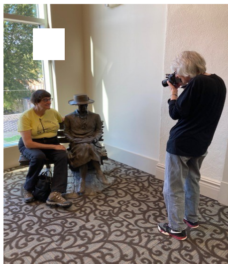
Three great writers share a moment at the fall conference in Red Cloud. The one in the middle is Willa Cather.