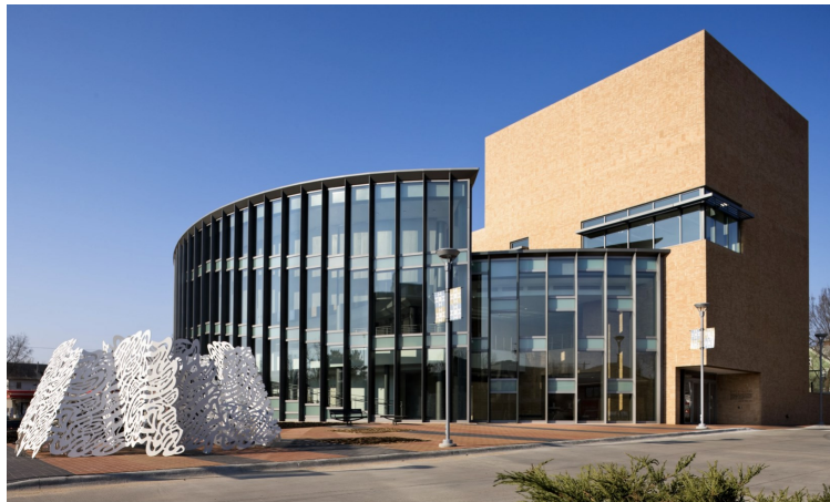
International Quilt Center

The deadline to reserve a room is 5 p.m. on March 24.