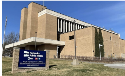
Nebraska Public Media